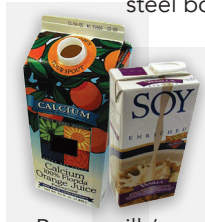
Paper milk/ juice cartons (no foil pouches, do not flatten)