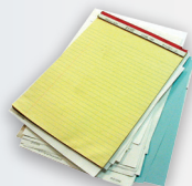
White or pastel office paper