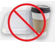
Styrofoam® & paper to-go boxes & cups