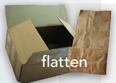
flatten Corrugated cardboard & paper bags