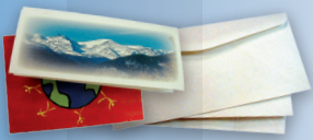
Opened mail & greeting cards

You can now place all recyclables in one bin!