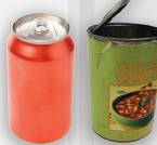
Cans (do not crush or flatten)